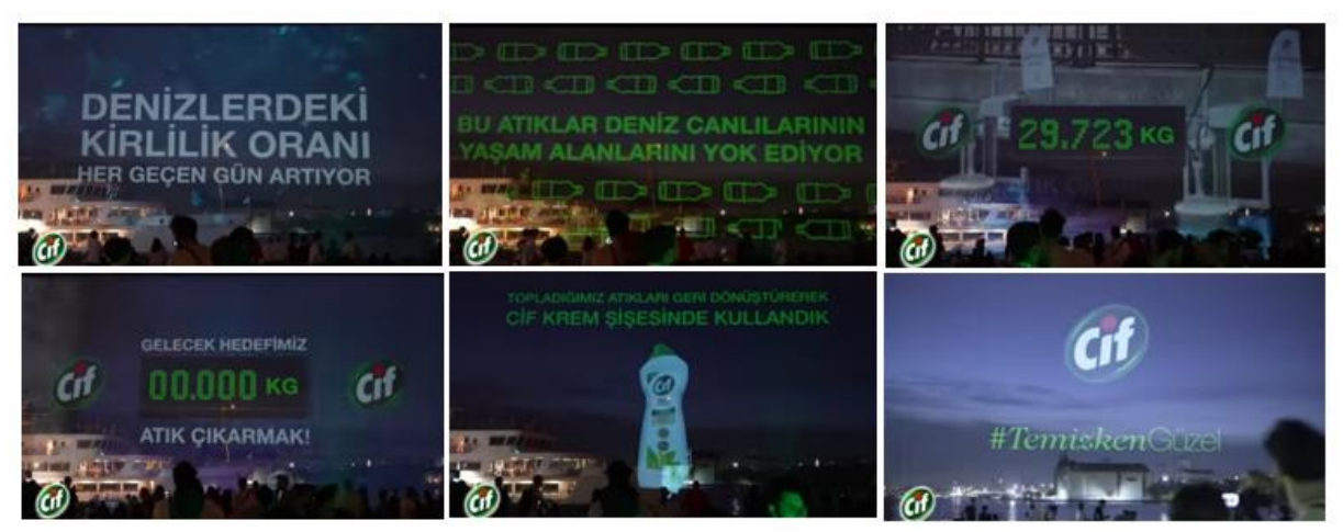
Image 7. Cif, Istanbul Metropolitan Municipality and Turkish Red Crescent's Fifth commercial film