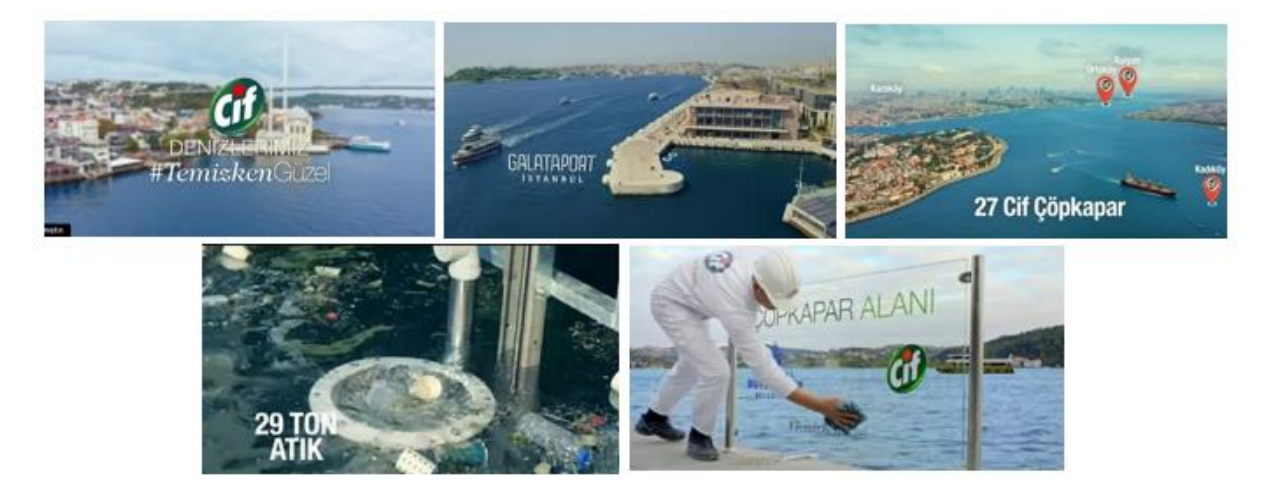
Image 5. Cif, Istanbul Metropolitan Municipality and Turkish Red Crescent third commercial film

Two indicators stand out in this advertisement, which is the second of the consecutive advertisements of the "Beautiful when Clean" project of Cif, Istanbul Metropolitan Municipality and Turkish Red Crescent. (a) Vehicle display; It is the "machine developed by Cif". Here, the garbage grabber vehicle produced by Cif is introduced. (b) Title indicator; It is "Beautiful When Clean". It is the slogan of the advertisement. It also emphasizes the cleanliness of the sea (see Image 4 and Table 4).