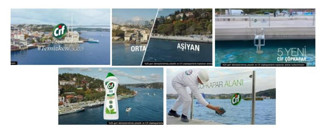
Image 6. Cif, Istanbul Metropolitan Municipality and Turkish Red Crescent's fourth commercial film