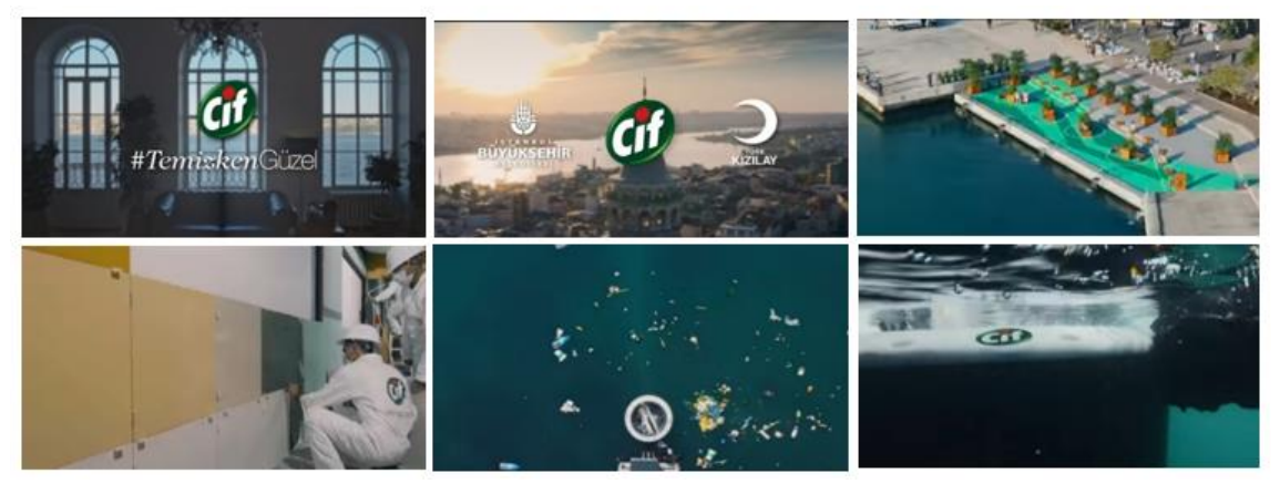
Image 3. Cif, Istanbul Metropolitan Municipality and Turkish Red Crescent commercial film

In this commercial, prepared by the Cif brand in partnership with the Istanbul Metropolitan Municipality and Turkish Red Crescent, the cleanliness of the city is emphasized. It was noted that the Cif brand made in accordance with the social distance rule in the Covid-19 pandemic, cleaning and renewing the park, underpasses, and then placing the cif garbage grabber product, specially produced for Cif, into the seas and collecting the wastes in the seas. Within the scope of the work started as the "Beautiful When Clean" project, five more advertisements were published as a follow-up to this advertisement. In this advertisement, it is underlined that the Cif brand, as a cleaning brand, attaches importance to the cleanliness of the cities, makes new initiatives, and most importantly, by producing Cif garbage grabber products that work non-stop, the seas will always remain clean and they recycle the waste they obtain from there. It has been pointed out that the Cif brand is an environmentally friendly brand.