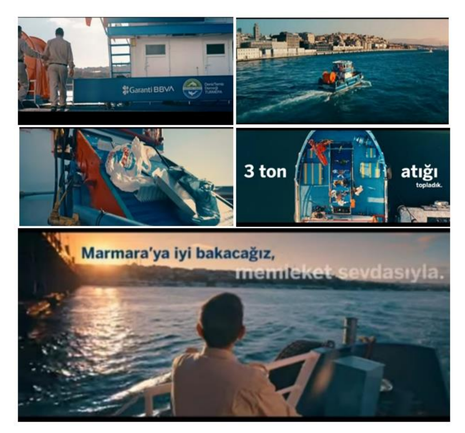
Image 2. Garanti BBVA and TURNEPA corporate social responsibility second advertisement

Four indicators were discussed in the social responsibility advertisement of Garanti BBVA and the Marine Association TURNEPA. (a) Human indicator; The famous actor who is the face of Garanti Bank is Fatih ARTMAN. Here the character is seen as the person who cleans the sea by boat. (b) Venue indicator; It is the Sea of Marmara and the boat on the sea. In the commercial, the Sea of Marmara full of garbage and the boat that collects the garbage in the sea, called a sea broom, are featured. (c) Action indicator; Cleaning the Sea of Marmara. Here is an individual working to clean up the garbage of the Marmara Sea. It is exhibited that this job is undertaken by the guarantee bank due to the value it gives to the country. (d) Title indicator; It appears as the expression "Love for the Country". At the end of the advertisement, it is emphasized that the guarantee bank gives trainings for sea cleaning, and we will take good care of Marmara. It ends with the sentence "For the love of the country" (see Image 1 and Table 1).