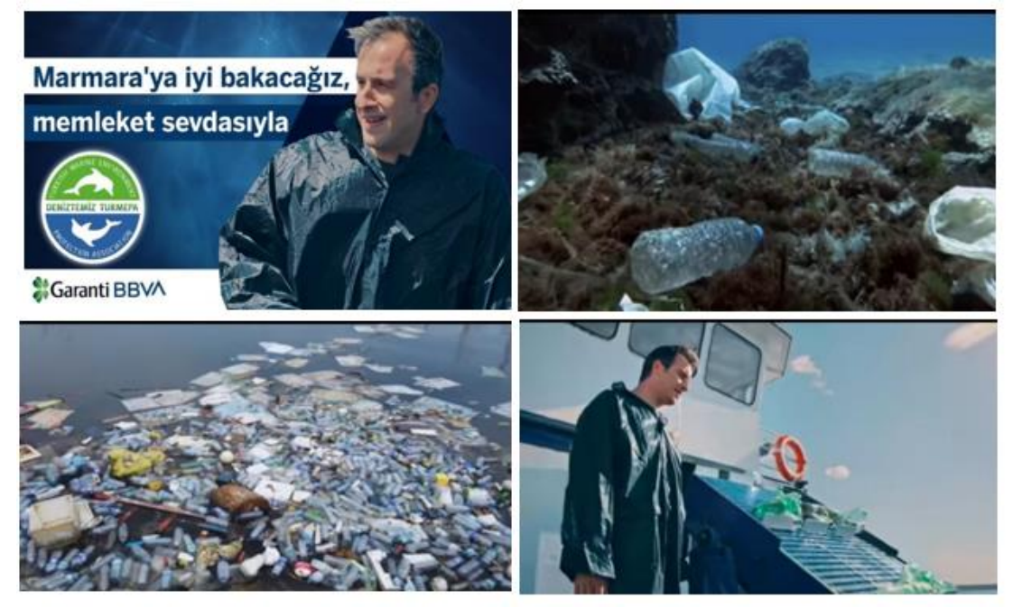
Image 1. Garanti BBVA and TURNEPA corporate social responsibility advertisement

Through the commercial film prepared with the partnership of Garanti BBVA and the maritime association TURNEPA, it was tried to create the perception that Garanti Bank is an institution that works hard for its country, is an environmentalist and supports social responsibility activities. The advertisement film, which was broadcast with the slogan "With the love of the country", emphasized the love of Garanti Bank for its homeland. Here, the message is given that they have taken it as their duty to clean the Sea of Marmara in cooperation with the Marine Clean Association TURNEPA, and that they are working for a cleaner future.