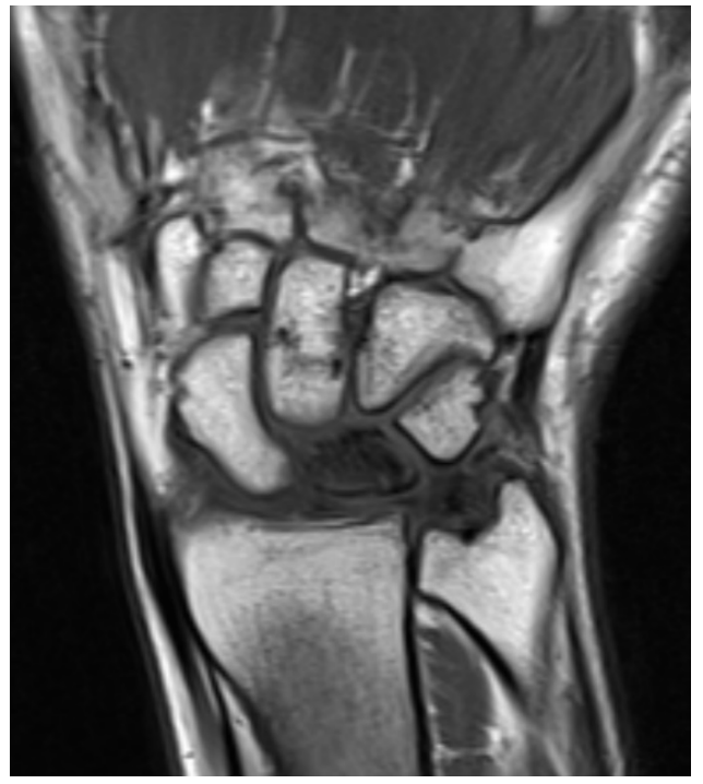
Figure 1: MRI image showing Kienböck's disease in a patient.