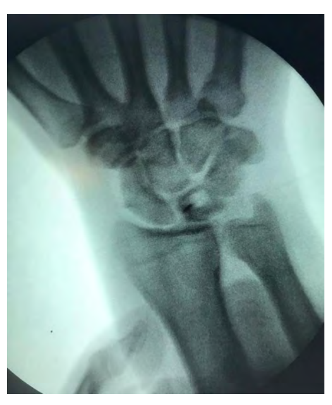
Figure 3: Fluoroscopy image of the lunate bone after removal of sclerotic bone fragments.