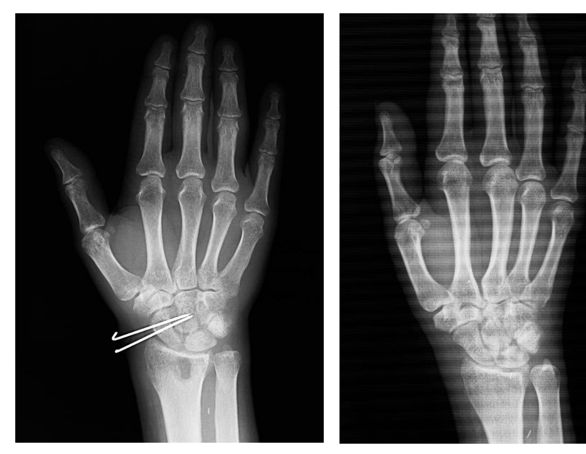
Figure 5: Radiograph of temporary scaphocapitate fixation with K-wires.