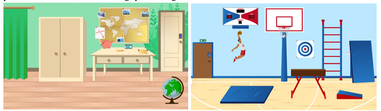
Figure 2: Traveler's Room

Currently, the potential of the computer application "Joyteka" for the development of its web quests for the use of gamification in the educational process is high [20]. Basically, "Joyteka" software is a tool for creating web quests. It allows you to create quizzes, games with terms, "exit the room" educational quests. The free version has 15 different rooms to choose from. Web quests can be assigned as homework or conducted directly in class with students. You can use the quest rooms here (Figure 2,3) as you wish, there are no restrictions. In such quests, children have the task of leaving the room using various objects, finding clues and solving logical problems. Hints (tasks) can be solutions, answers to advance the plot of the quest. To find clues, children should consider predictable situations: move a cabinet somewhere, open a safe somewhere, enter a code from the numbers on the clock, water the flowers, charge the phone, etc. At the end of the road, children will be rewarded, because gamification means rewards, points, statuses in games, but it is better to pay more attention to internal "rewards", that is, positive emotions, self-learning, peer recognition of internal achievements, interest.