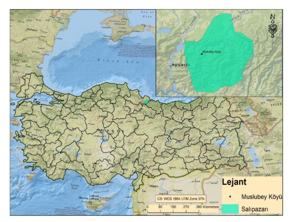
Figure 1. Location map of the study area.

The experiment was set up in Muslubey Village of Salıpazarı District, Samsun Province (Figure 1). Some properties of soil and the hazelnut husk used in the experiment are given in Table 1. Accordingly, the trial garden has soil with a clay loam texture, with an organic matter value of 2.87%, and a bulk density of 1.12 g/cm<sup>3</sup>. The hazelnut husk used in the experiment was kept covered for 75 days, releasing its bitter green juice. The C/N ratio of the hazelnut husk used was 15.51, the pH value was 7.86, the EC value was 0.62 dS/m, and the OC value was 34.55%.