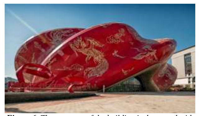
Figure 6. The entrance of the building is decorated with the curtains of traditional Chinese theatre symbolises. Reference: Steven Chilton Architects.

fabric, symbolizes the traditional Chinese theater, which was once restricted but has been revived in a contemporary form. According to Ahuja, each fold in the outer shell is designed to symbolize the Guangzhou valley, where silk is processed [10]. The folded shell hangs down at one end of the structure and is finished with another folded entrance. This curved entrance is also a reference to the iconic curved curtains of traditional Chinese theater that were once banned, and it is intended to highlight the main entrance of the theater (Figure 6).