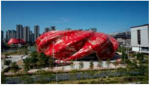
Figure 5. Sunac Guangzhou Grand Theather's form source is a silk fabric and phoenix created with parametric design tools. Reference: Dezeen.com

In this study, the Sunac Guangzhou Grand Theater, which takes on cultural symbols and architectural elements of traditional Chinese theater through parametric design, will be investigated as an example. The cultural symbols that form the source of the theater's design will be analyzed in the context of Jakobson's communication model, and the contribution of parametric design to societies that recreate their cultures through architecture and the ability of parametric design to transmit local culture will be examined. One of the most important features of Guangzhou, where the theater is located, is that it is the center of silk production and the starting point of the Silk Road. Moreover, the city, which is also the birthplace of the myth of the "phoenix" bird, which has an important place in Chinese culture, was also one of the important centers of traditional Chinese theater culture in the past, which was restricted during the Mao era. Silk fabric and phoenix bird images were used as form sources in the design of the exterior shell of the structure. The fluidity of silk fabric was digitized through parametric design algorithms, combined with the shape resembling the wings of the phoenix bird, and refined again through parametric algorithms to reach the final geometry (Figure 5). The use of the image of the phoenix, which can be reborn from its own ashes in mythology, alongside the image of silk