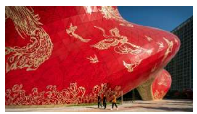
Figure 7. Facade, is made of perforated aluminum to support its flexibility and curved form, and it is painted in red, representing Chinese culture and art. Reference: Steven Chilton Architects.