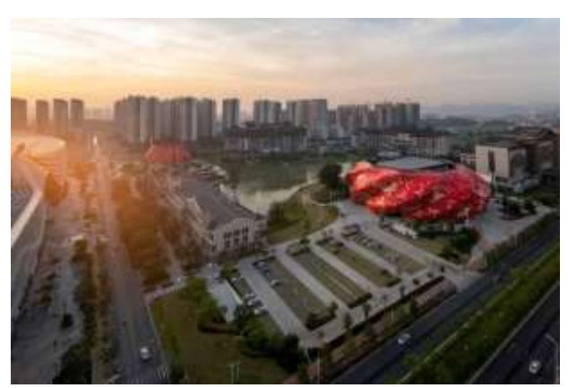
Figure 4. Sunac Guangzhou Grand Theater. Reference: Steven Chilton Architects.

in its culture, and more than 400 theaters have been built in just the last decade of the 21st century [9]. In the design of theaters, not only elements of Western culture, but also elements from traditional Chinese theater designs and symbols representing Chinese culture were used, and parametric design was mainly preferred due to its use of local culture and associated topographic elements as form sources, as well as its iconic form and size understanding. Sunac Guangzhou Grand Theater can be considered as one of the most important examples of these theater structures both culturally and symbolically (Figure 4).