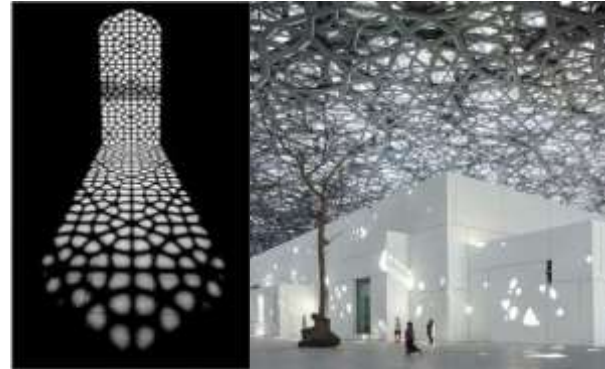
Figure 3: The roof of the Louvre in Abu dhabi parametric mashrabiya It is designed by reconsidering it through algorithms.

Relation Between Culture and Architecture can be established through the use of information as a source of form through parametric design. This can strengthen the cultural qualities of a structure. The "Abu Dhabi Louvre Museum" located in Abu Dhabi can be considered as an important example in this regard. The roof of the structure has been reconsidered in a contemporary form through parametric design, utilizing the traditional component of Arab architecture, the "Mashrabiya" (Figure 3).