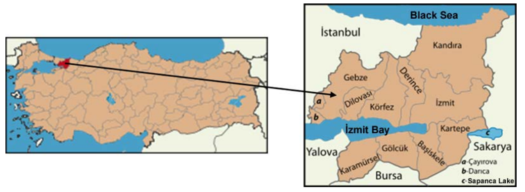
Figure 1. Geographical location of Kocaeli

The study was carried out among 30 primary schools and 19 high schools and their equivalents located in İzmit, the central district of Kocaeli Province, between the years 2013-2014. Kocaeli Province is located in the Marmara Region and surrounded with Black Sea in the north; Bursa in the south; İstanbul in the west and northwest; Sakarya in the east (Figure 1). The Province consists of 12 districts including central district İzmit. The central district, İzmit, is a coastal settlement near the eastern end of İzmit Bay. Data, visuals and observations derived through field studies carried out at schools which are located in the İzmit district; documents obtained from the administrations of each school and Kocaeli Provincial Directorate of National Education and previous researches that had been carried out on the subject matter form the main material of the study.