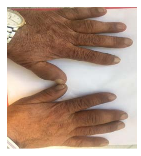
Figure 1. Swelling of the patient's hand fingers

Gouty arthritis, most commonly affect metatarsophalengeal joint. This condition can also have an asymmetrical polyarticular distribution. It can affect hand joints included DIF in the later stages of the disease<sup>3</sup>. Our patient had normal uric acid level and no complaint about lower extremity and also radiologic images were not compatible with gout arthritis.