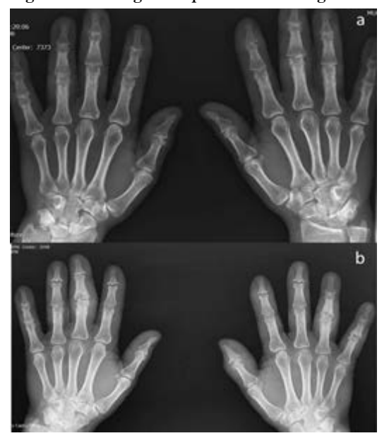
Figure 2. X-rays of initial examination (a) and after 2 years of follow-up (b). Figure 2a shows narrowing of the joint spaces in distal and proximal interphalangeal joints and also erosions in DIP joints. Figure 2b reveals central erosions and partially ankylosis.