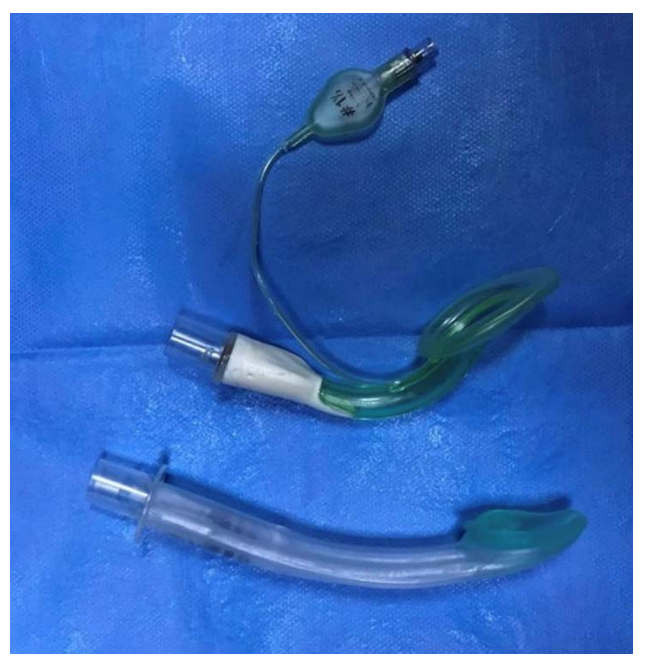
Figure 1. I-gel LMA and Ambu Aura-i LMA

Pediatric patients are quite different from adult patients and have specific respiratory features. Laryngoscopy and intubation-related complications are higher in this age group. SADs, placed more easily than endotracheal intubation, resulting in less hemodynamic changes and less airway trauma, have an essential place in pediatric patients in current anesthesia practice (2,3). In addition to short surgical procedures, they are also used for expected and unexpected airway difficulties. i-gel and Ambu Aura-i are the new generation SGA (2,3) (Figure 1).