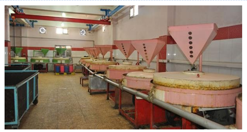
Figure 3. Date Molasses and Tahini Production, Source: (URL-1).

The aggregate quantities of molasses and Rashi equate to a total of 36 tons, where the district's internal consumption constitutes 27 tons, accounting for approximately 75% of the monthly production volume. The remaining portion of 9 tons is channelled to the broader governorate for distribution (Salam Khamees, 2008). Notably, the renown of Hit extends to its production of molasses and al-Rashi, as reflected by the presence of five small-scale enterprises engaged in their manufacturing. These enterprises collectively employ a workforce of 16 individuals and are situated in the Kanaan area situated to the north of the city of Hit (F. Al-Mohammadi, 2011).