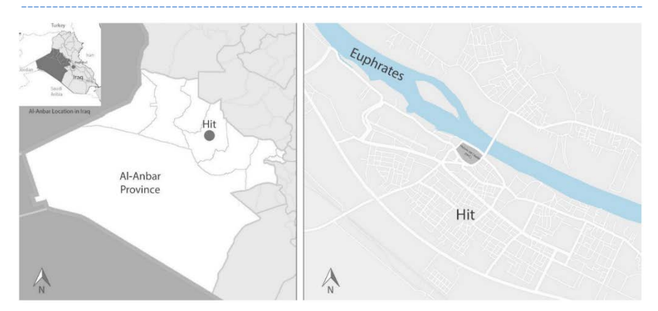
Figure 1. The location of the city of Hit with Anbar Governorate and Iraq.

Within this region lie remnants of historical monuments that stand as testaments to a bygone city and an ancient civilization that flourished millennia ago, now recognized as Old Hit or Hit Castle. Historical records reveal intriguing details, including the utilization of the city's esteemed tar, renowned for its quality, in the crafting of Noah's Ark. Further historical links emerge, as the tar from Hit played a pivotal role in adorning the towers of the legendary city of Babylon. These historical threads serve as vital anchors for historians going into the profound historical legacy of Hit and its enduring castle (Ubaid, 2019). Fig. 2 shows Hit City at the current time.