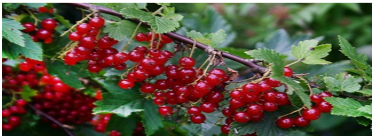
Figure 5. Blackurrant (Habertürk, 2021).

Dogwood: Dogwood is a tree species belonging to Bolu and the surrounding region, known to belong to the dogwood family. The tree grows up to 5-8 m in length. The leaves of the tree are dark green, veins are parallel and hairy along the veins. The small yellow flowers bloom in February-March. The fruits are elliptical in shape and red in color. Cranberry fruit can be consumed fresh or dried, as well as tarhana, sherbet and marmalade. Sandwiches, fish with cranberry, cranberry tarhana, stuffed leaves with cranberry and salad with cranberry are among the dishes made with cranberry fruit (Koca et al., 2006). The Figure of cranberry is shown in Figure 6.