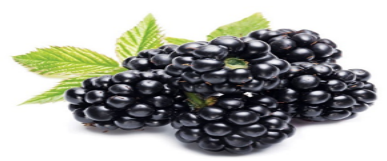
Figure 4. Blackberry Figure (Blackberry, 2023).

Blackberries: Blackberries are consumed both fresh and dried. Blackberries are consumed as marmalade, preserves, cakes, ice cream and the pulp is used as fruit juice and liqueur. The leaves are collected in spring and dried. Dry leaves are boiled and drunk. With the pectin substance it contains, it is used for thickening in pastry and for making jelly in kitchens (Radovanović et al. 2013, Yang and Kortesniemi 2015). Blackberries are rich in minerals, vitamins and organic acids. For this reason, it is very beneficial for human health. These plants cleanse the blood, break down toxic substances in the blood and facilitate the sweating process (Ağaoğlu, 1986; Pehluvan and Güleryüz, 2004). Blackberry syrups are useful for people suffering from respiratory and pectoral diseases (Keipert, 1981, Radovanović et al. 2013, Yang and Kortesniemi 2015). Figure 4 shows an Figure of blackberries.