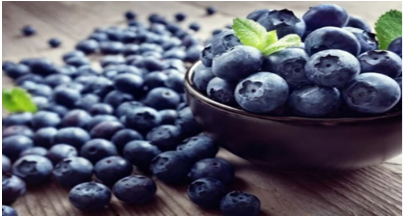
Figure 9. Blue berries [blueberries] (NtvHaber, 2023).

Blueberry extracts are widely used in the food and pharmaceutical industries. It can be used dry or wet. In milk and dairy technology; it can be added to kefir, ice cream, milk or yogurt. It can be consumed as jam, marmalade and tea (Rowland, Hancock & Bassil, 2016). An Figure of blue berries is shared in Figure 9.