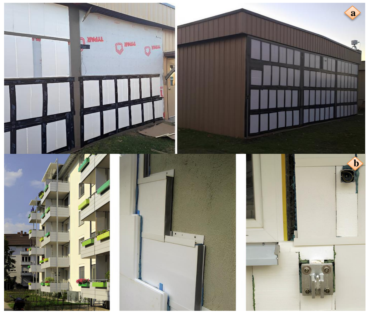
Figure 2. a) Low-cost VIPs for energy-efficient retrofit of external walls [23], and b) hybrid external wall insulation of VIPs with EPS foams [24].

Vacuum technology is another key solution to meet the latest low/zero carbon building standards [22]. Vacuum medium is often considered the best-known thermal insulator owing to its complete lack of atoms. VIPs are the efficient applications of the vacuum concept in buildings. In most cases, VIPs are accepted as the most effective TSIMs since they are an ideal, reliable, and easy-to-implement option for retrofitting old and poorly insulated buildings [23]. Especially in recent years, low-cost and highly insulative VIPs are at the centre of interest, there are several attempts in this respect as shown in Figure 2. The thermal conductivity of the said VIPs is about 0.0041 W/mK at room temperature conditions, which is outstanding [23]. The fact that VIPs allow efficient insulation not only from the outside but also from the inside makes these products remarkable, especially in the restoration of historical buildings [17]. VIPs, in some cases, are also used in combination with conventional insulation materials like expanded polystyrene (EPS) foams both to maximise the surface covered by VIPs and to prevent potential thermal bridges [24].