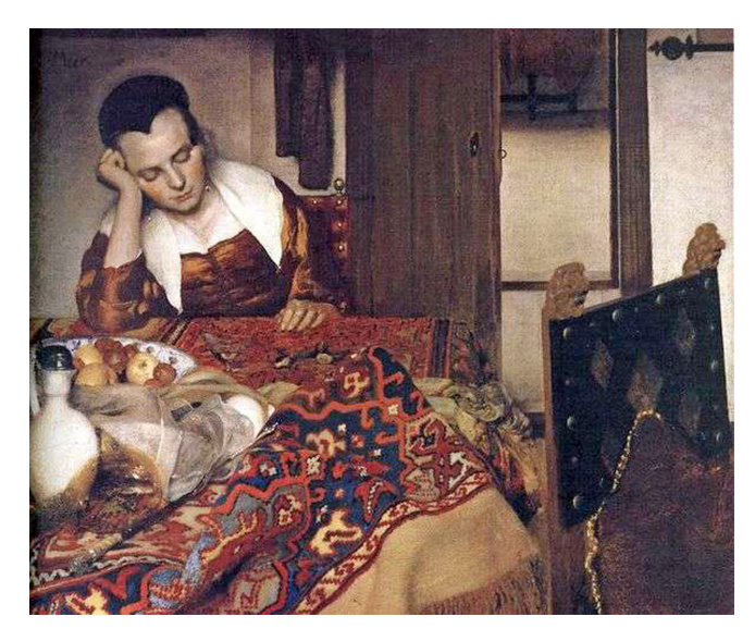
Image 3. Jan Vermeer. Sleeping girl. 1657. Canvas, oil. 87.6 × 76.5 cm. (Vermeer, 1657)

pinnacle of Azerbaijani carpet weaving, the oldest dated carpet in the world. As one of the largest (35 million knots) and historically important carpets in the world, it, along with a pair of carpets, is stored in the Victoria and Albert Museum in London. The pair was woven in 1539–1540 in Tabriz and was in the temple in Ardabil until the XIX century, after which they were taken to London (Anonymous, 2018).