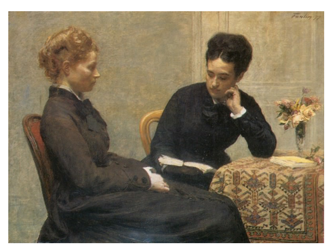
Image 4. Henri Fantin Latour. Reading. 1877. Oil on canvas, 97 × 130.5 cm. (Latour, 1877)

Azerbaijani carpets were not only a luxury item in the paintings of famous artists of the XV–XVI centuries; they are also kept in various museums of the world and private collections and exhibited at many auctions in the world. The oldest and most ancient carpets are kept in the Museum of Fine Arts in Boston, the White House, Philadelphia and the Metropolitan Museum in the USA, the Vatican, the Louvre in Paris, the Hermitage, and the Victoria and Albert Museum in London. The Goja carpet, woven in the XVII century in Karabakh, is stored in the Metropolitan Museum of Art.