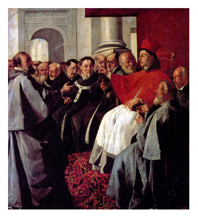
Image 6. Francisco de Zurbaran. Saint Bonaventure at the Council of Lyon Cathedral. 1637. Oil on canvas, 250 x 225 cm. (Zurbaran, 1637)

The splendor of silk carpets and threads of gold and silver color has been known since the Sassanid era, which fell in the III–VII centuries, and to the delight of art critics and connoisseurs, it has been further developed. Carpets were woven with gold and silver threads, and precious stones were woven into the fabric, which later took on a traditional character in the XVI–XVII centuries.