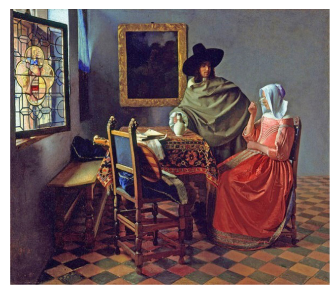
Image 5. Jan Vermeer. A glass of wine. 1660. Oil on canvas, 66.3 × 76.5 cm. (Vermeer, 1660)

According to typology, Azerbaijani carpets are divided into pile and lint-free carpets, as well as carpet weaving schools in accordance with the regions of Azerbaijan.