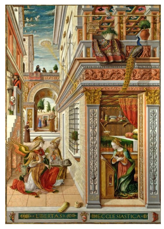
Image 7. Carlo Crivelli. Annunciation with Saint Emidne. 1486. Wood, later oil on canvas. 207 × 146 cm. (Crivelli, 1486)

Azerbaijani silk carpets are sung in an original way in the epic work "Kitabi Dede Korkud" (Anonymous, 2020).