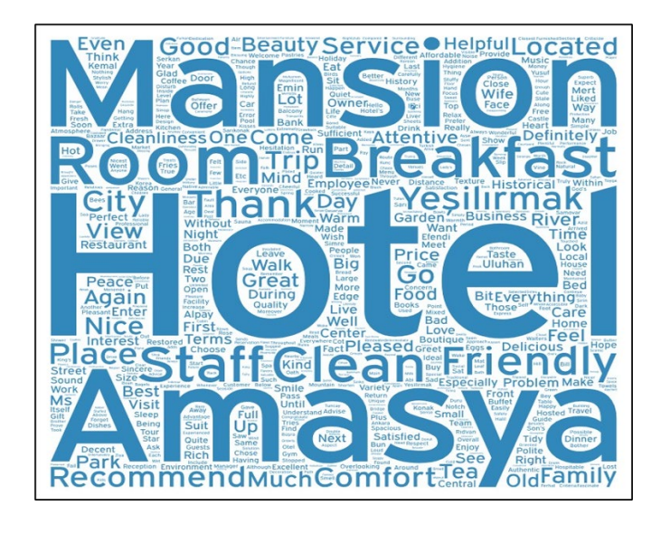
Figure 3: Word Cloud of Positive Reviews of Mansion Hotels in Amasya

It has been determined that some tourist comments about mansion hotels in Amasya on the TripAdvisor platform are not made only for business. Apart from mansion hotels, the city, transportation, shopping, local people, etc. Since there were comments and opinions on these issues, comments that had nothing to do with mansion hotels were eliminated. As seen in Table 3, only the comments and ratings of the host hotels were selected, and their data was analyzed. Accordingly, the weighted average scores of Amasya's 10 mansion hotels, which have the most tourist comments on the TripAdvisor platform, were "4.17" out of "5" as a result of tourist experiences. Therefore, the Amasya mansion hotels evaluated received a score well above the average score of 3. Accordingly, it can be said that the comments and scores of tourists who have experienced the mansion hotels in Amasya are mostly positive. The figures in Table 4 also reflect this. Of the 637 comments evaluated, 503 were in the positive comment category, and 134 were in the negative comment category. On the other hand, the scores of the evaluated comments in Table 4 are very close to the general scores in Table 2, providing a fair content analysis opportunity.