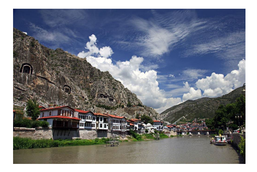
Figure 2: Yalıboyu Houses (Amasya Provincial Directorate of Culture and Tourism, 2023)

Amasya province, with its natural beauties and historical values, has many attractions in terms of tourism. According to accommodation statistics with business licenses between January and December 2022, the number of local and foreign tourists staying in Amasya is 188,434. It is known that historical mansions, which have been restored and serve as accommodation facilities, and hotels with operating certificates meet the accommodation needs of incoming tourists. As of November 2023, there are 21 facilities with tourism operation certificates and 54 facilities with simple accommodation operation certificates in Amasya province. In addition, 21 facilities with tourism operation certificates have 1,332 beds, and 54 facilities with simple accommodation operation certificates have 1,090 beds (Ministry of Culture and Tourism, 2023). The most notable tourism types in Amasya province are cultural heritage tourism, nature-based tourism, bicycle tourism, camping and caravan tourism, ornithotourism, and thermal tourism (Amasya Provincial Directorate of Culture and Tourism, 2023). Figure 2 shows mansion hotels operating as accommodation establishments in Amasya.