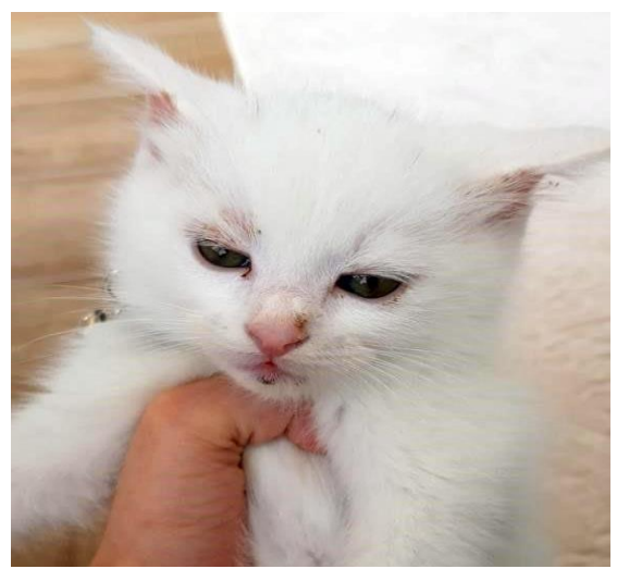
Figure 3. Complete hair removal of alopecia areas 8 weeks after treatment.