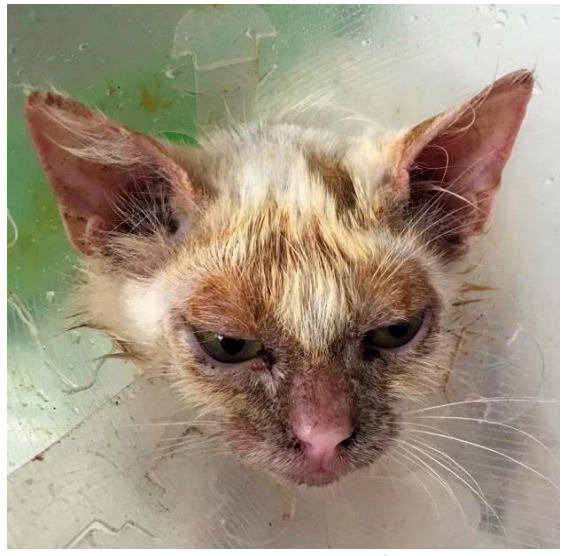
Figure 2. Appearance at 4 weeks after treatment.