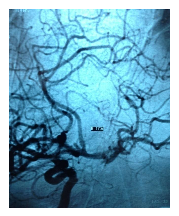
Figure 3. Angiography from right ICA showing ACoA left MCA perfusing via AcoA.

Figure 2. Angiography revealed an aneurysm of the ACoA.