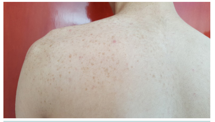
Figure 2 and Figure 3. Millimetric macules on the left side of the body and left upper back

PUL is a macular pigmentation characterized by numerous lentigines on the upper extremities, where they are 3 times more common compared with the lower extremities [3]. The prevalence is similar in male and females [4]. The lesions generally occur during early childhood [5]. PUL should be differentiated from nevus spilus, which has a hyperpigmented background and a more stable course over the years, since the lesion grows in proportion to the patient [6]. Histologically, PUL exhibits a lentiginous epidermal proliferation of melanocytes and elongation of the rete ridges [7].