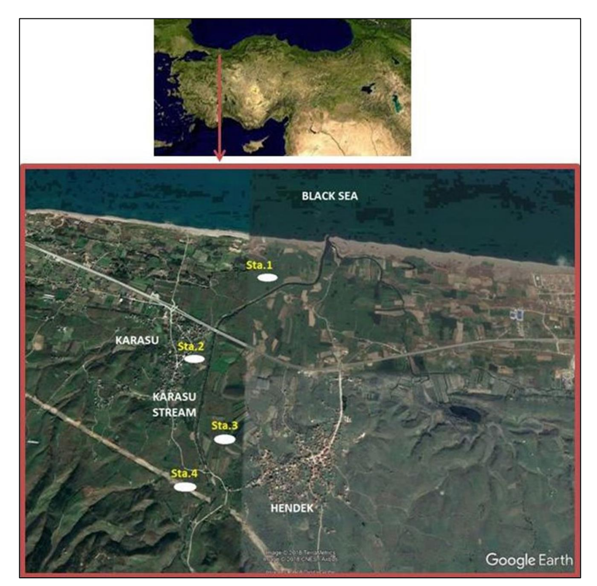
Figure 1. The study area and stations

This study was carried out on Karasu River located in the lower part of Sakarya River basin (Turkey). This river is originated from Çataltepe near Hendek. It first flows to north with the name Kabalak Stream. After it merges with Yayla Stream, it takes the name of Karasu and it is poured from Karasu district to the Black Sea. The length of study area is approximately 30 km. Four stations were chosen on this river and samples were taken seasonally between January 2008 - October 2008 (Figure 1). Totally, 16 samples had been performed per site/single sampling from four stations at four seasons.