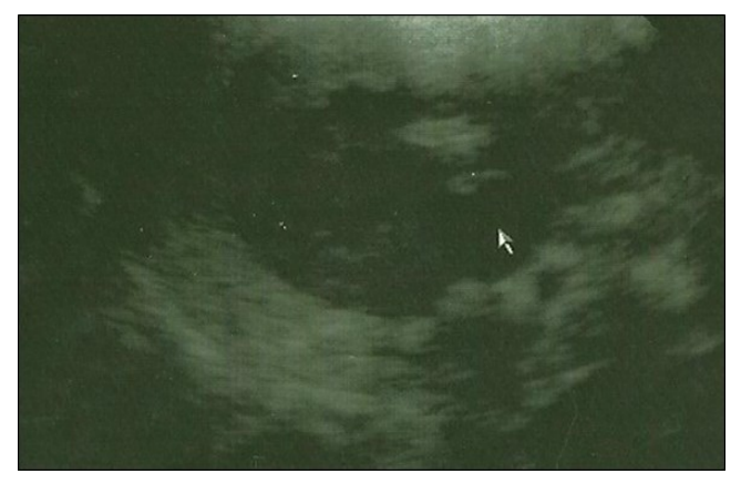
Figure 4. Dog 2. Longitudinal scan of small bowel segment distension with loss of wall layering due to the enteritis.

first day, fluid was administered over 24 hours. Gradual oral alimentation started with Hills I/D prescription diet<sup>®</sup> as vomiting ceased. Metoclopramide HCl (Metpamid®) (1.0 mg/kg.IM q8h and then 0.5 mg/ kg.IM q8h.) was preferred as antiemetic and ranitidine (Ranitab®) (2.0 mg/kgSCq8h. then 1.0 mg/kg.q12h. and continued with 0.5 mg/kg.q24h.) in order to protect gastric mucosa. Antimicrobial therapy was started with β-Lactam antibiotic (Ampicillin/ 22mg/ and kg.IV/TID) (Ampisina®) aminoglycoside (Gentamicin/ 4mg/kg.IV/TID) (Genta®) was added once the rehydration was established. The therapy was supported with Vitamine B complex (Bemiks Kompoze (<15 kg.; 1-5ml.) Ascariasis was treated with pyrantel pamoate (Kontil®) (5mg/kg. PO) and in order to increase HCT value, blood transfusion was performed to the first patient.