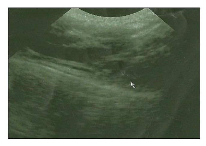
Figure 2. Dog-1. The thickening in intestinal wall and the intestinal loops with a low content as they lost their individualization. The striated structure is visible on the left side.

treatment. The same day Dog-1's albumin level was measured 2.7 g/dL and Dog-2's glucose level 70 mg/dL. Intestinal USG was performed for both puppies with a 5-7.5 mHz transducer. The figures 2, 3, 4, 5 represent two dimensional B-Mode images of the ultrasonographic findings such as altered intestinal wall structure and damaged intestinal individualization.