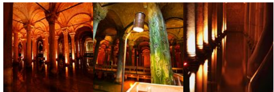
Figure 2. Yerebatan Cisterns (URL 1)

Our country received an average of 597.6 mm of precipitation in 2016 (01 January - 31 December). Precipitation was about 24 mm higher than normal and 12 mm higher than last year's rainfall. The use of alternative water resources technologies is becoming increasingly widespread throughout the world in the recent period when the effects of water stress are beginning to be felt more and more. It is known that in traditional practices, solutions such as the use of rainfall waters in appropriate seasons and use them when needed are widely used. There are water wells around historical buildings. The use of cisterns for collecting rainwater is very common in traditional houses near water wells. (Figure 2)