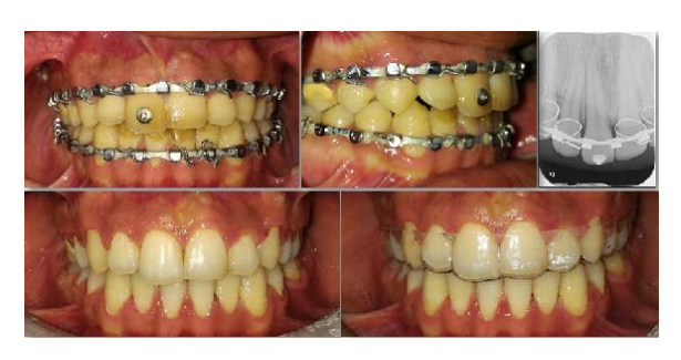
Fig-4. Photographs and radiography of the intraoral appearance after tooth intrusion of case-1