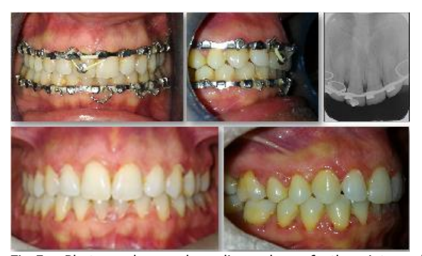
Fig-5. Photographs and radiography of the intraoral appearance after tooth intrusion of case-2