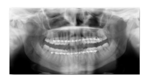
Fig-2. Radiography of case-2

tooth. Patient had a good cooperation and good oral hygiene. (Fig-2)