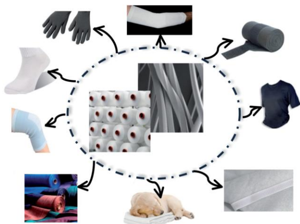
Figure 2. FIR textile products [18].

the risk of injury. FIR textile products can help to heal injured, over engineered muscles, tendons and bonds [2], [27].