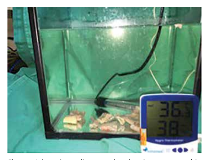
Figure 1. A thermal controller was used to adjust the temperature of the water close to the body temperature.

No statistically significant difference was observed between initial temperature measurements before the application of each laser. The temperature of specimens irradiated with diode laser was significantly increased compared to specimens irradiated with ErCr:Ysgg laser (p<0.05) (Table 2). There was no statistically significant difference between the mean temperature values of bone and soft tissues before and after laser application (Table 3).