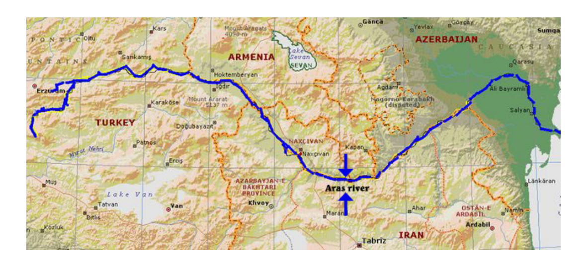
Figure 4. Map of the Aras River Border (Heidari, 2011: 430)

At the beginning of the 19<sup>th</sup> century the Russian Empire expanded into the Caucasus and challenged the borders of the Persian Qajar Empire in a series of wars. In 1828 negotiations led to the Turkmanchai Treaty, which divided the greater Azerbaijani region between the Russian and Persian Empires along the Aras River (Swietochowski and Collins, 1999: 129). Azeri people found themselves living in two different countries: in the south, they remained as a large minority in the Persian Empire, while in the north, they were incorporated into the Russian Empire. Nonetheless, aṣiqs still travelled frequently between the two regions and remained in close contact.