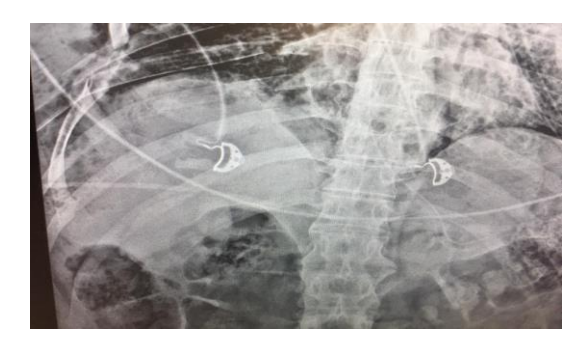
Figure 1. X-ray scan.