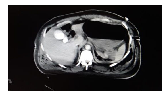
Figure 2. Abdomen CT scan.