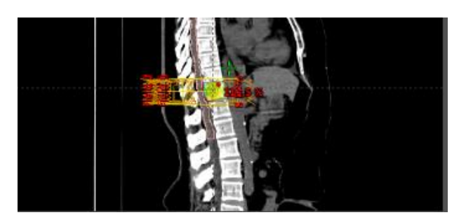
Figure 3. Image of the dose distribution from the lateral area.

agreement was obtained in the Gamma analysis with the criteria. Gamma analysis yielded a 99,4% compatible result when compared to two separate plan 3-DVH software, which were calculated using 0,1 and 0,5 cm resolution in the planning system.