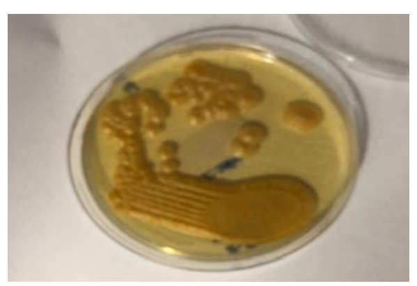
Figure 2. Creamy moist colonies on SDA.

treatment. He was followed up on outpatient basis.