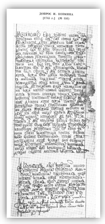
Figure 1. Interrogation reports samples, Сумкина (1981).