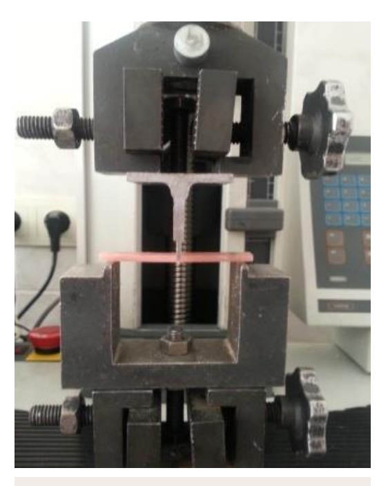
Figure 1. Three -point bending test

where E is the energy that breaks the specimen (J), W is the width (6 mm) and T is the thickness of the specimen (4 mm).