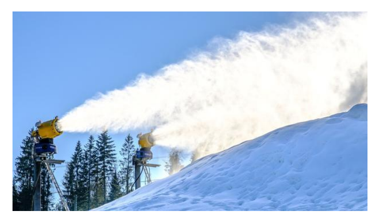
Figure 2: Artificial snow represents 30% to 35% of stations' surface

However, destinations may consider adaptation measures to be taken and applied in order to avoid losing tourist stream, they can, for instance, invest in artificial snow technology in order to have their station covered with enough snow and ice for a successful ski season. In this case, such stations would be reliable in terms of snow coverage, but several issues might be encountered.