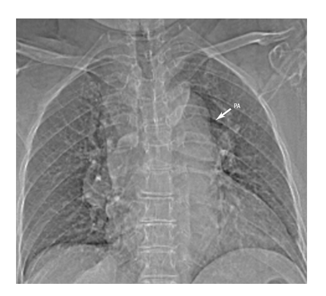
Figure 1 . Antero-posterior chest x-ray shows aneurysmal main pulmonary artery and its branches in central and peripheral localizations

On physical examination, arterial blood pressure was 100 / 60 mmHg and radial pulse was regular with a rate of 100 / min. Cardiovascular system examination was normal except tachycardia. In teleradiography, a prominent pulmonary artery was detected (Figure 1). On transthoracic echocardiography, right and left ventricular size and functions were normal, but the main pulmonary artery and its branches were excessively dilated . Doppler echocardiography revealed mild tricuspid and pulmonary regurgitation. Pulmonary artery systolic pressure measured through tricuspid regurgitant flow was 32 mmHg and diastolic and mean pressures of pulmonary artery were detected to be 14 and 18 mmHg respectively. In multislice CT angiography, main pulmonary artery was measured to be 55 mm at the level of the aorticopulmonary window. Left pulmonary artery was 32 mm and right pulmonary artery was 42 mm (Figure 2). The patient underwent endoscopic examination of the larynx and the left vocal cord was found to be fixed in the paramedian position.