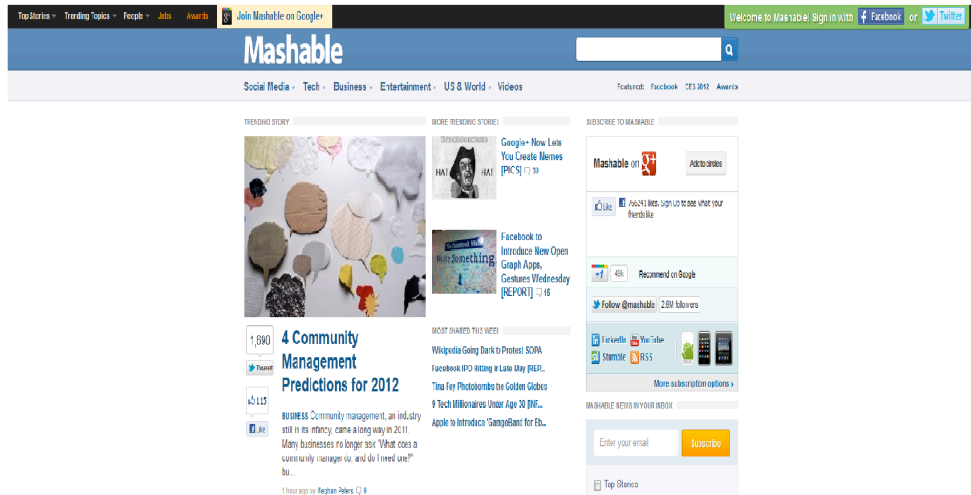
Figure 2. Mashable, heading and main part