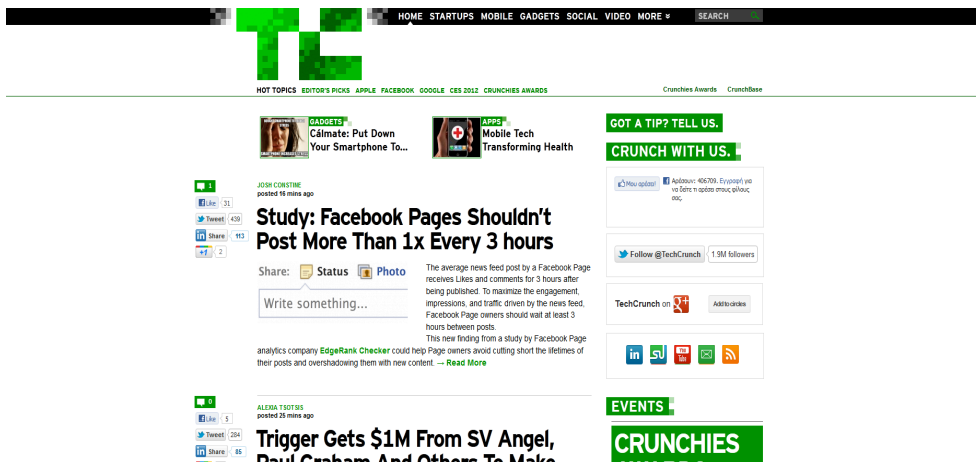
Figure 4. TechCrunch, heading and main part

The color blue strengthens the emotional tranquility, serenity, pleasure and recuperation. Moreover it favors the ethical and honest addressing of survival issues while it expresses seriousness, responsibility, knowledge, trust, authority, and melancholia. Typical is the fact that the color blue is used in news blogs. The white color which is used by most blogs represents harmony and signifies simplicity, perfection, innocence, truth, youth, honesty, light, wisdom, sanctity, the spiritual authority and veracity.