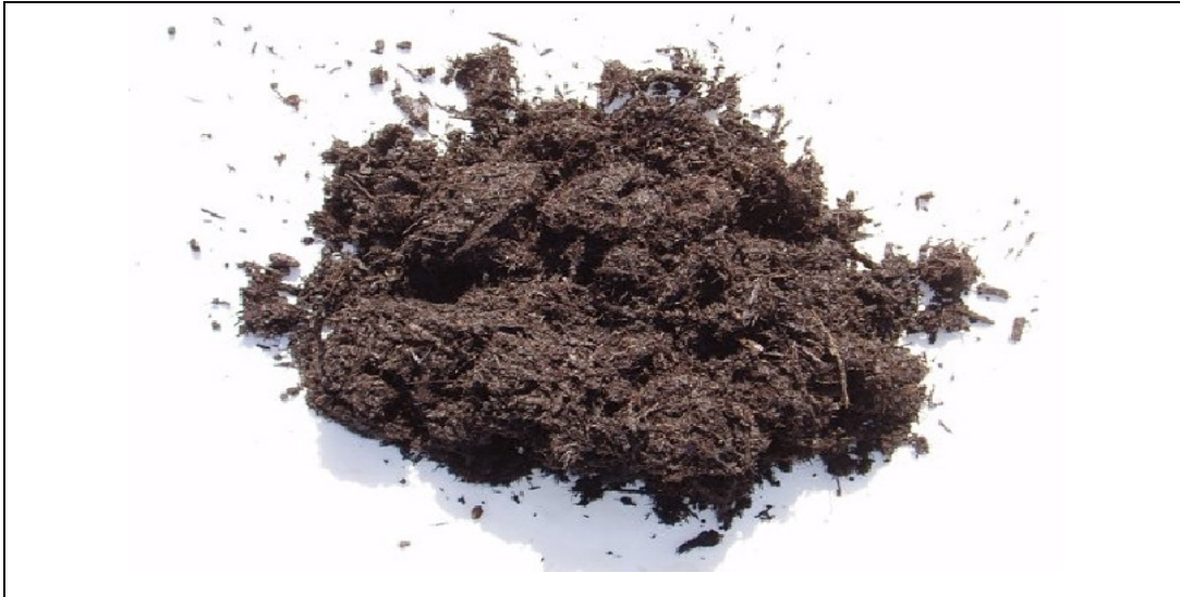
Fig.1 Lithuanian peat moss

3. Determination of pH. The pH values in water medium of the analyzed samples, pure sapropels and control sample (peat) were determined with a pH meter, Model WTW, Germany, (ISO 10390).