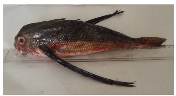
Figure 2. Dactylopterus volitans captured in Ece Bight, Gallipoli Peninsula (Northern Aegean Sea, Turkey).

Climate change controls the rate of change in the geographical distribution of marine species or populations in the sea. Climate variability also directly affects fish recruitment, a key process for fisheries. Changes in marine currents, derived from atmospheric climate variability, may modify transport and survival of larvae and juveniles, as well as the distribution and abundance of phytoplankton and zooplankton.