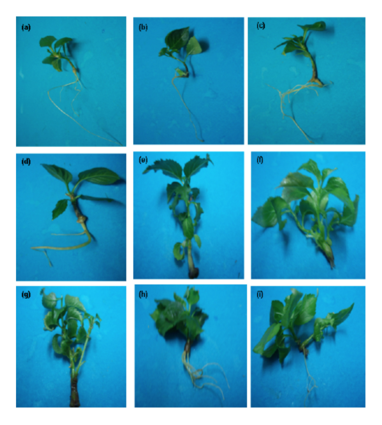
Figure 1. Rootstock CAB-6P: (a) Minus DS treatment with the longest roots, (b) 40 \mu M DS with the smallest root number, (c) Maximum root number with 150 \mu M DS, (d) 4 times less root length with 150 \mu M DS; Rootstock Gisela 6: (e) Minus DS treatment (control) with no shoot proliferation, (f, g) Shoot multiplication with 80 \mu M DS (h) 20 \mu M DS produced the greatest root number, (i) Production of multiple shoots and roots in the same explant with 80 \mu M DS