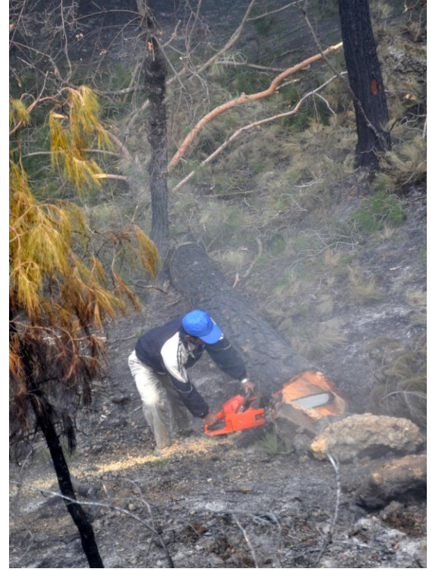
Figure 3. Hazardous working conditions during felling of fire-damaged trees

Due to intensive logging activities in the field, they suffer from vibration and noise related physical hazards. The severity of these hazards highly depends on the duration of exposure (Ponten, 1998).