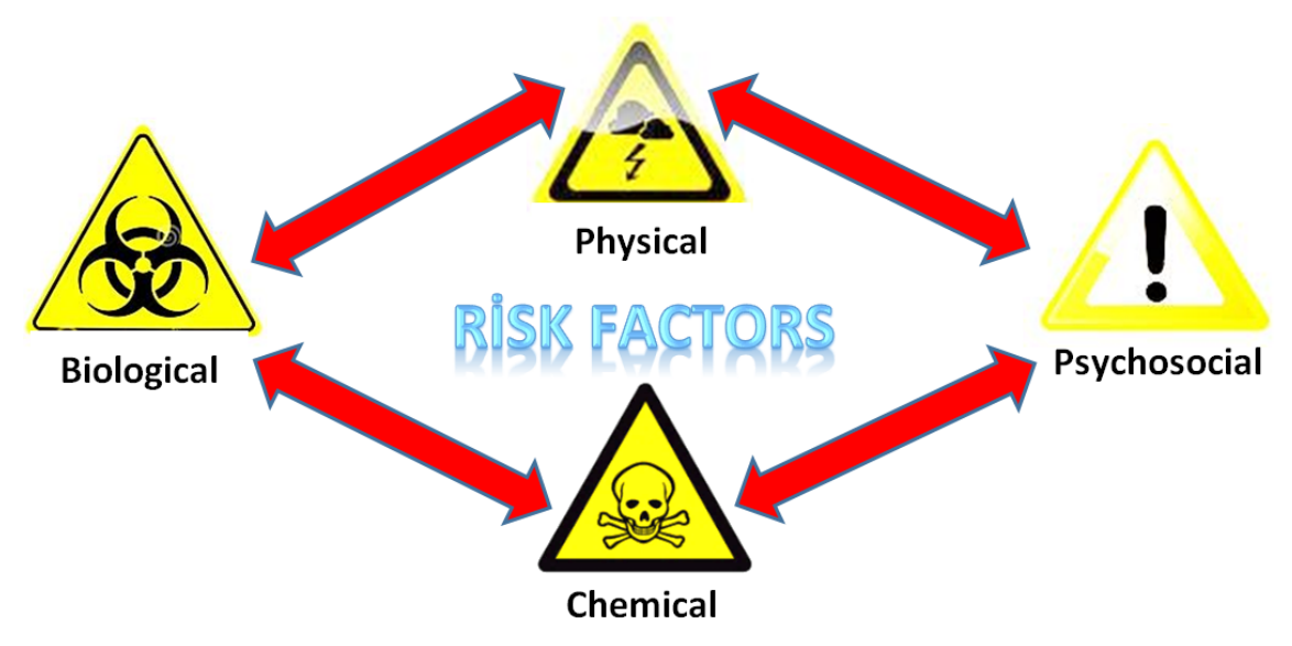
Figure 1. Main risk factors in logging operations

The loggers potentially suffer from heavy load related health problems during logging operations which require intensive use of muscle power. These health problems may include muscle injuries, backache, neck and shoulder sickness, and arm and leg pains (Akay and Yenilmez, 2008). The traditional logging methods relaying mainly on man power requires very heavy workloads (Ponten, 1998). Table 1 indicates energy expenditure required by various logging activities (Durnin and Passmore, 1967). Working in inappropriate working posture also cause serious strain injuries and increase the risk of accidents (Enez, 2008).