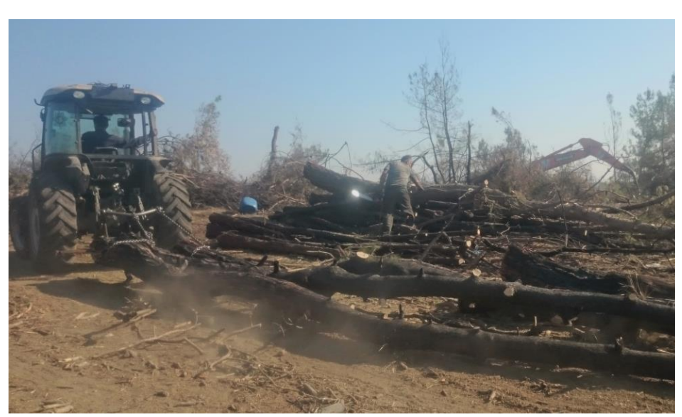
Figure 5. Salvage logging operations on dusty ground in burned Brutian pine stand of Bursa, Turkey

In timber salvage activities, the loggers often work on difficult terrain and slippery surface which increases risk of unforeseen accidents especially using draft animals for logging. Draft animals used during logging operations should be trained to safely drive or pull various equipment on difficult terrain. Other biological hazards may include danger of poisonous creatures that stayed alive after low-intensity fire and hiding under debris. Therefore, the logger should be extra careful when removing debris during salvage logging activities.