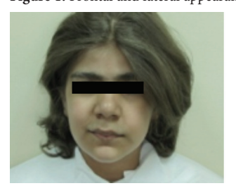
Figure 1. Frontal and lateral appearance of the patient.