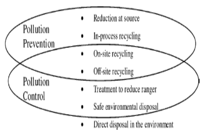
Figure 2. Evolution of the methodologies to design and manage eco-efficiency (Cagno et al, 2003).

sustainability of the local clean production center and its activities and financial mechanisms to facilitate affordable environmental investments. This study handled Clean production in a wide concept and tried to encourage the development of "holistic view". It examined new job а opportunities and how clean production concept integrated with foundations (Kjaerheim, 2003). Although this study examines new iob opportunities and other trends which support clean production applications, it does not mention importance of plant layout in point of incensement of clean production performance. As it can be easily understood successful clean production projects provide profitability. A significant study was made that represents the link between clean production and profitability by examining 132 industrial pollution prevention projects (Cagno et al, 2003). Hierarchical pollution prevention 1990 U.S. is illustrated that was first defined in October 1990 U.S.