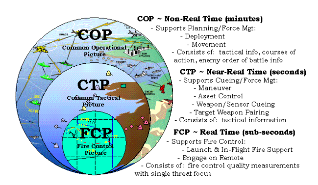
Fig. 1. Managing Resources in Battle Force

This concept is elaborated in (Johnson and Green, 2002) in detail. The COP consists of nonreal-time tactical information used for mission planning and force management. The CTP consists of near-real-time tactical data and information used for cueing and managing BF resources. The FCP is the collection of real-time fire control quality data/measurements used to support weapons during launch and in-flight.