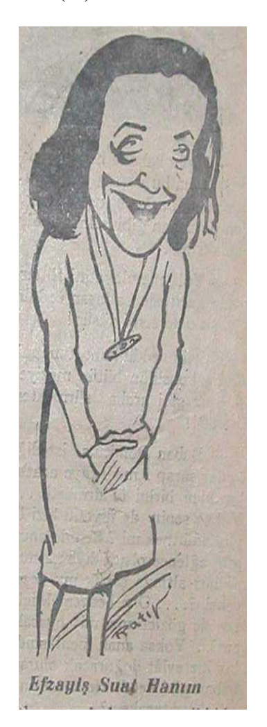
Figure 7: Efzayiş Suat 20 April 1930, Milliyet