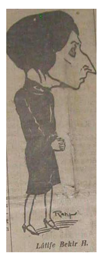
Figure 6: Latife Bekir 18 April 1930, Milliyet