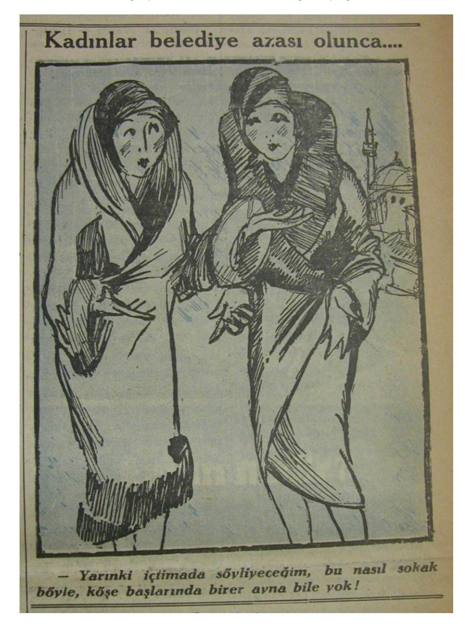
Figure 2: 25 March 1930, Vakit

The Parliament members: We want a word, we want a word! Mrs. Deputy President: Let me, let me put my lipstick!