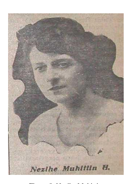
Figure 8: Nezihe Muhittin 6426