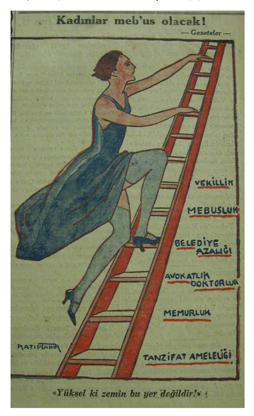
Figure 3: 26 March 1930, Cumhuriyet

Introductory caption: Women will become deputies! (Newspapers) From bottom to top: street cleaning, public service, advocacy-doctorship, membership of municipal council, deputyship, membership of parliament "Rise, this is not the place you ought to be!"