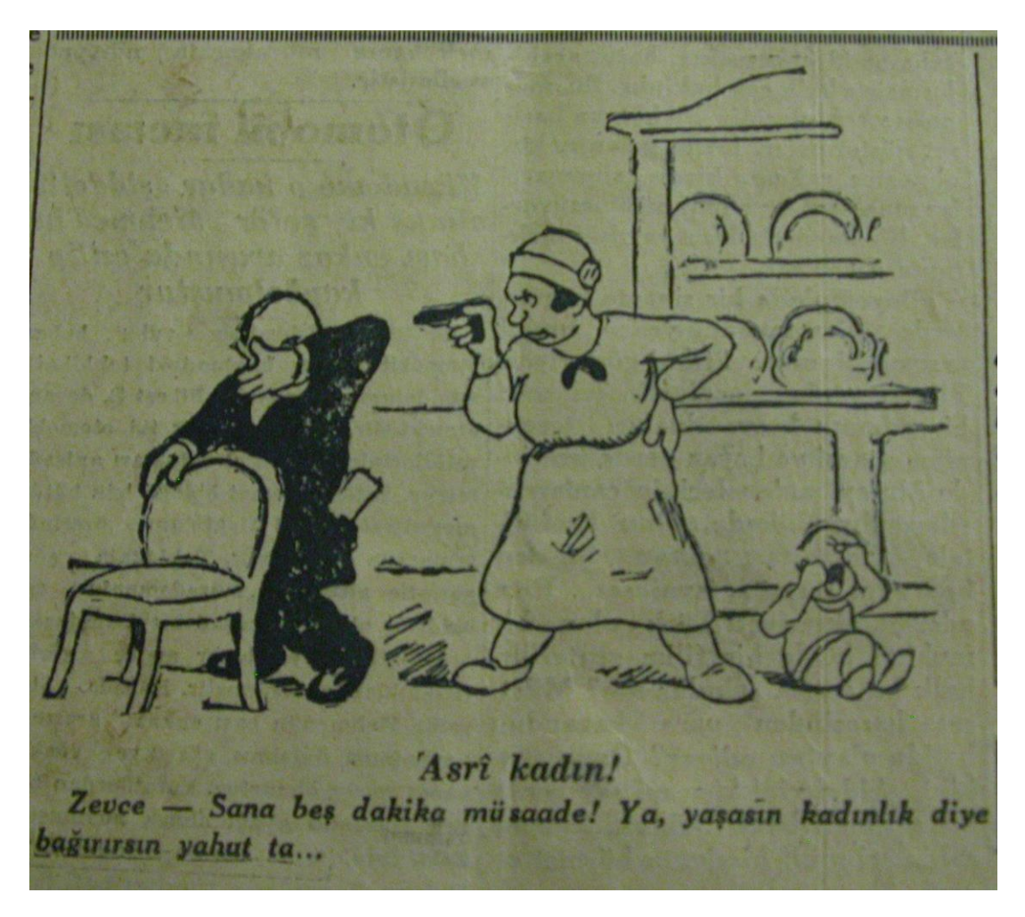
Figure 4: 24 March 1930, Cumhuriyet