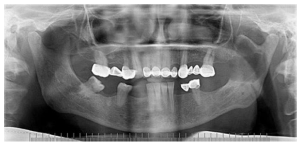
Figure 5: Postoperative panoramic radiography

On the second day following surgery, the drain was taken out and on the seventh day the sutures were removed. The patient was non-symptomatic and there was no postoperative condylar fracture or paresthesia (Fig 5). The patient is checked in regularly visits.