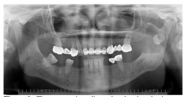
Figure 1: The panoramic radiography showing dentigerous cyst associated with an ectopic third molar in the subcondylar region.

Panoramic radiography revealed a large, well-defined radiolucency surrounding the crown of a deeply impacted left mandibular third molar at the subcondylar area (Fig 1) and Computed Tomography (CT) confirmed a well-defined unilocular radiolucent lesion which is related to an unerupted mandibular molar and close anatomical relationship between the molar roots, cyst, and the mandibular canal and also confirmed lingual cortex destruction through on the left ramus (Fig 2a,2b). Based on clinical and radiological findings dentigerous cyst, radicular cyst, fibrous dysplasia, and ameloblastoma were suspected.