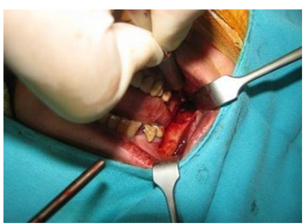
Figure 3. Intraoperative photograph.

The patient was prescribed postoperative antibiotics (Amoxicillin /Clavulanic Acid and Ornidazole), analgesic (Paracetamole), and mouthwash (Chlorhexidine Gluconate/Benzydamine Hydrochloride) for five days and adviced to remain on a soft and liquid diet for four weeks.