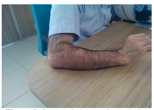
Figure 4: Concentric contraction exercise Statistics: Statistical analyses were performed with the SPSS 13 program using the X^2 test and comparison of percentages.