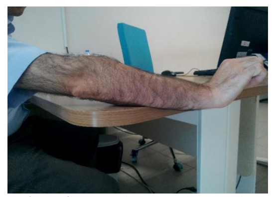
Figure 3: Eccentric contraction exercise