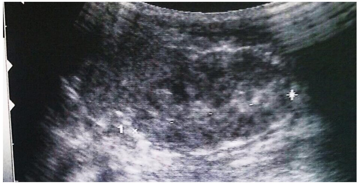
Figure 2. Left pelvi-caliectasis