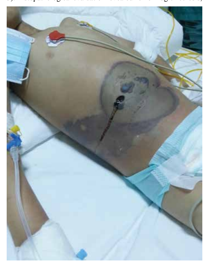
Figure 1. An ulcerated, necrotic lesion measuring 10x12 cm on the anterior abdominal wall

requested. Bacterial growth was not detected on blood, and biopsy specimen cultures Neutrophenic patient received granulocyte-colony stimulating factor, and intravenous immune globulin. Treatment: All necrotic tissue under the skin and subcutaneous tissue were excised down to healthy tissue. Then drainage was achieved using vacuum assisted closure (Figure 3). Histopathological evaluation revealed hemorrhagic necrosis,