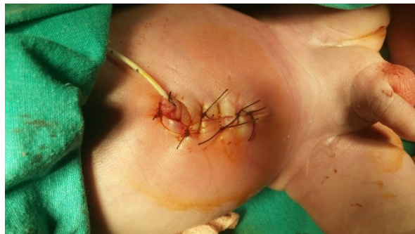
Figure 2. Primary repair of gastroschisis.

Surgical procedures were performed under general anesthesia after tracheal intubation, and prevention of hypothermia. Incision was extended vertically on either side for 2 cm. Intestinal tract was not atretic. There were no other abnormalities in the newborn. Abdominal wall defect was primarily closed without the need for silo reduction (Figure 2). Although on routine screening test TSH value was detected as 70 \mu IU/ml, since the test was performed within the first 24 hours of life this result was deemed to be false positive