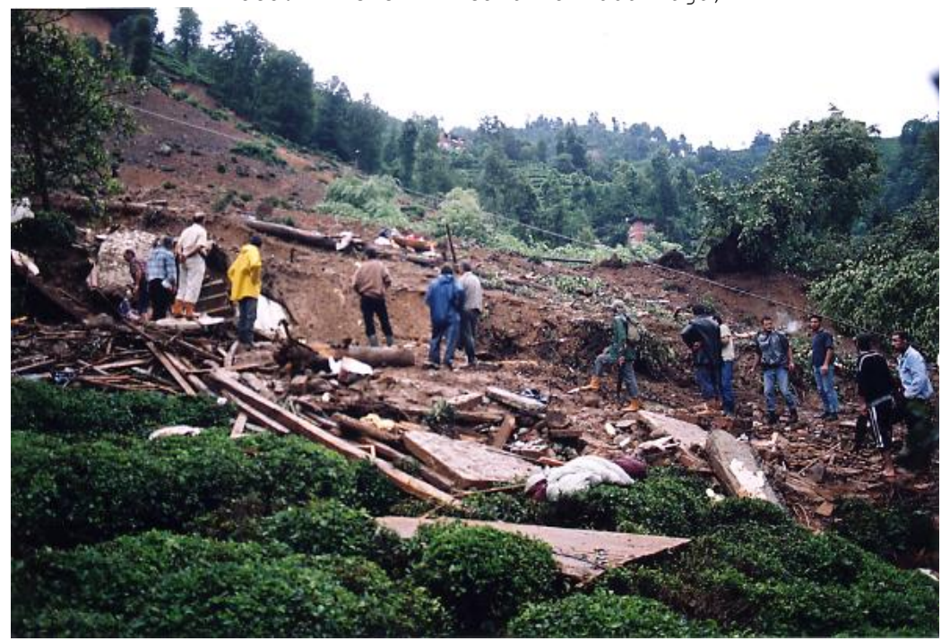
Photo 4. The tea garden which was destroyed by lanslide in Çayeli (2003). Photo: The Civil Defence management of Rize (Fotoğraf 4. Heyelanla tahrip edilmiş çay bahçesi-Çayeli (2003) Fotoğraf: Rize Sivil Savunma Müdürlüğü)

Photo 3. The search and saving activities in Çayeli-2 (2003) Photo: The Civil Defence management of Rize (Fotoğraf 3. Çayelinde arama ve kurtarma faaliyetleri (2003). Foto: Rize Sivil Savunma Müdürlüğü)