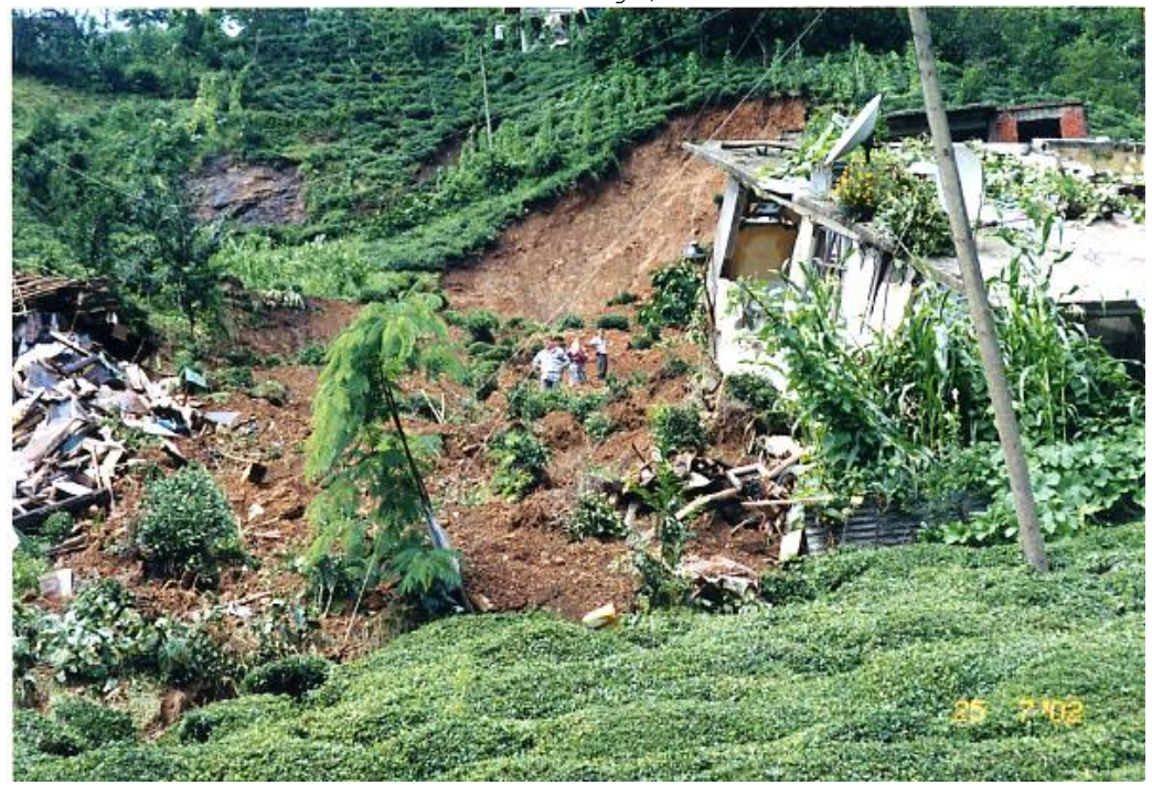
Photo 2. The search and saving activities in Çayeli 1 (2003) (Fotoğraf 2. Çayelinde arama ve kurtarma faaliyetleri 1 (2003).)

Photo 1. landslide in Çayeli (2003). (Fotoğraf 1. Heyelan Çayeli (2003).)