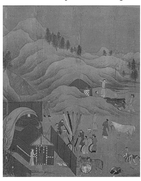
Picture 5- Hun Khan's Tent Ts'ai Wen Chi Poem's Picture, 11. Century National Taiwan Museum

Hun emperor Liu Yao's (AD.319-329) father's 18 meters cairn work was stopped for the financial problems. After that to stop the rebellion of Tibetans, Yao were attacking the Ho-his area with his 285, 000 soldiers. Too long army marched with its army band. Bells and drums was available this band. The high volume of these instruments was shaking everywhere. Who hearing the voice of band was afraid of (Baykuzu 2005: 6). This resource is another example of, the using of bell in the tuğ team that period.