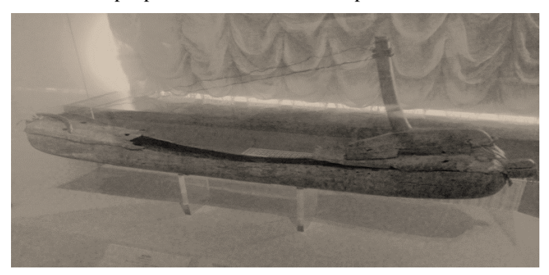
Picture 2- Harp Instrument In Hun Period BC.5-4

Chinese sources report that Hun emperors had an interest in music in their palaces and they had music groups to perform for them (Budak 20096: 22). A significant part of the information on the Hun period has been obtained from archeological findings, especially from Hun burial sites called "cairn" (kurgan). The musical instrument in Picture 2 ² is a Hun harp, which was found in the second Pazırık cairn and believed to date back to 5th-4th century BC. This instrument made from leather and wood is significant artifact that demonstrates how sophisticated the music culture was in Hun period. This and the Sumerian harp shows similar characteristics in that they were both produced as open harps which can stand firmly and they had similar timbre cases. Such instruments prove to be good examples of interaction between cultures. "A drum-like percussion instrument made of horn was also found next this harp in the same cairn." (Diyarbekirli and Çoruhlu 1972-2007: 17, 93) The findings from these cairns indicate the importance that the people of rank in the Hun Empire attach to music.