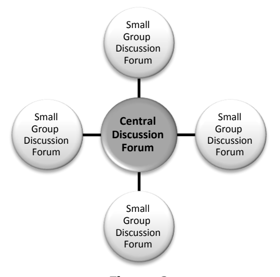
Figure: 2 Levels of the discussion groups.