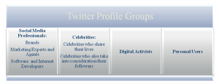
Figure 1: General User Profile Groups in Twitter