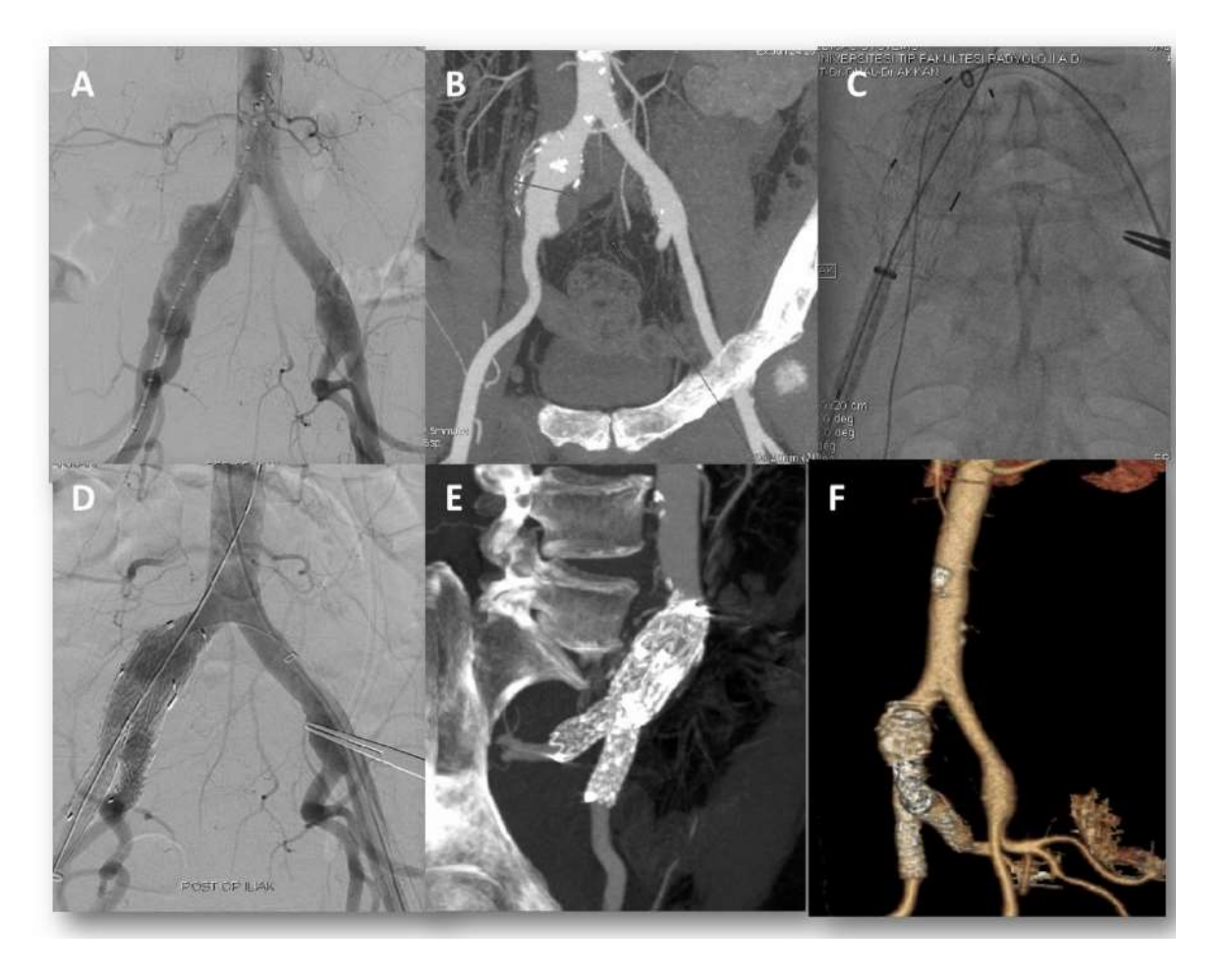
Figure 1: A, B : Aneurysmatic dilatation of nearly 40 mm in a 6 cm segment of the right common iliac artery C: Positioning of branched stent-graft D: Postoperative DSA E: Postoperative MIP CT F: Postoperative 3D CT