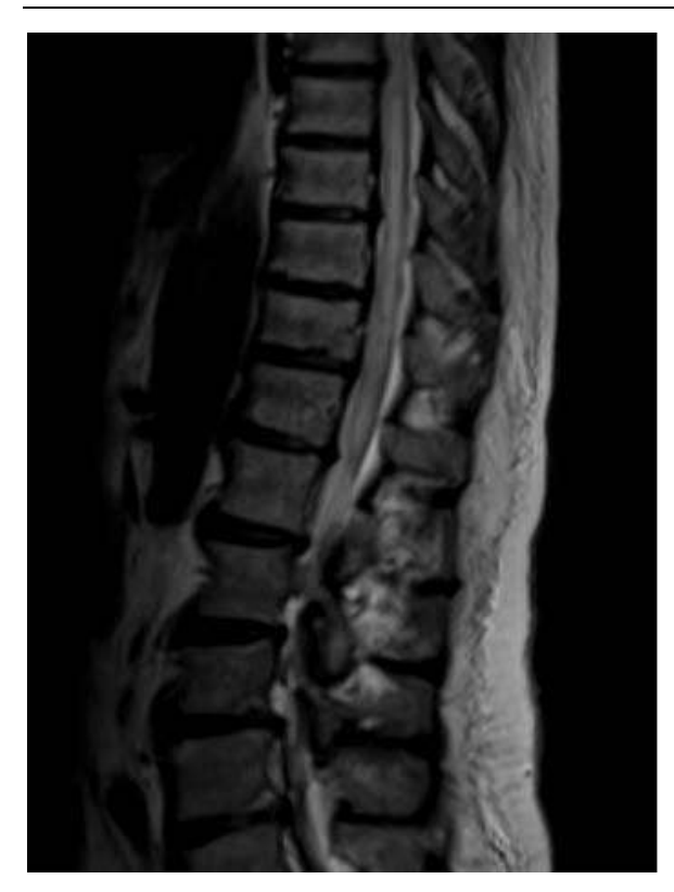
Figure 3: Dorsal and Lomber Spinal MRI showed a diffuse non-contrast-enhancing lesion which impacts on pyramidal tracts