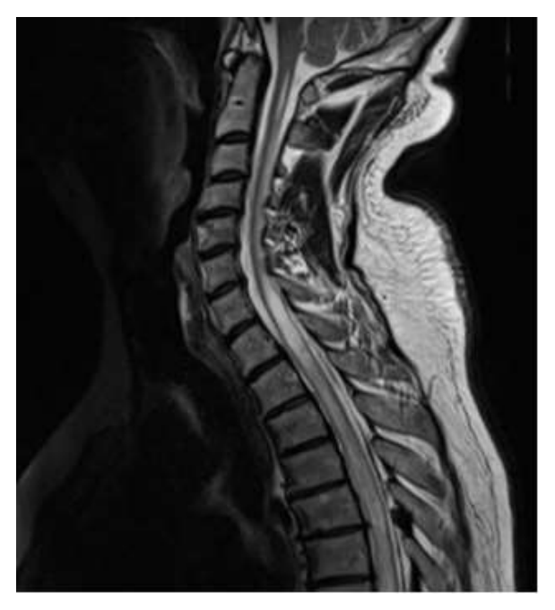
Figure 1: Cervical Spinal MRI showed a diffuse, non-contrast-enhancing lesion

HTLV 1-2 virus antibodies examined and found to be as negative. Methylprednisolone 1 gr/day was given intravenously for 10 days and a brief recovery period was observed. Intrathecal baclofen pump was used to reduce the spasticity in his legs and some progress has been achieved. The patient was also mobilized with the physical therapist. The diffuse lesions were observed to best able in the further control MRIs. Patient consent form has been approved by the patient for this presentation and article.